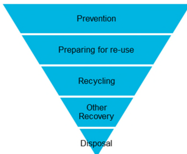
Plate B1 Waste hierarchy