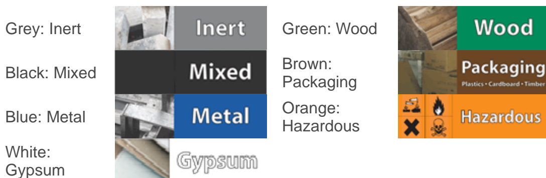
Plate B2 Waste container colour codes